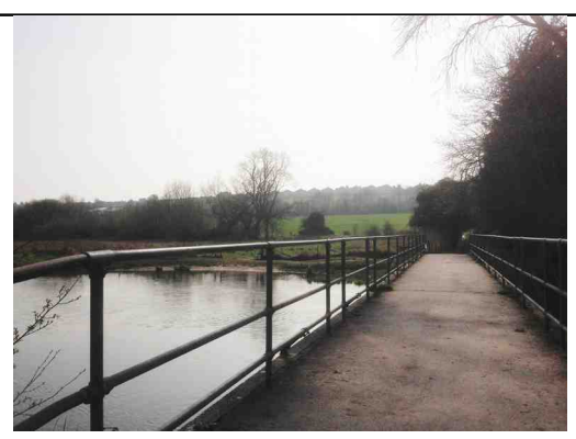
Distance from Start 0.23 miles

Further examples of these and other plants of marshland can be seen further along the route.