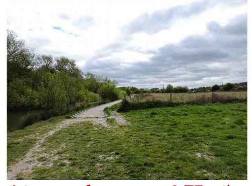
Distance from start 0.75 miles