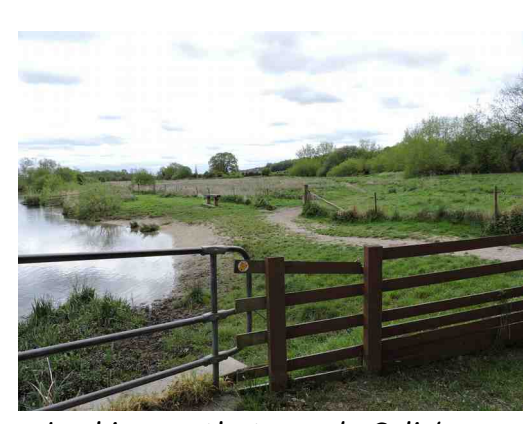
Looking south, towards Salisbury

Exit the bridge and just past the wooden fencing, turn left through the wide gap and follow the footpath towards a wooden bench.