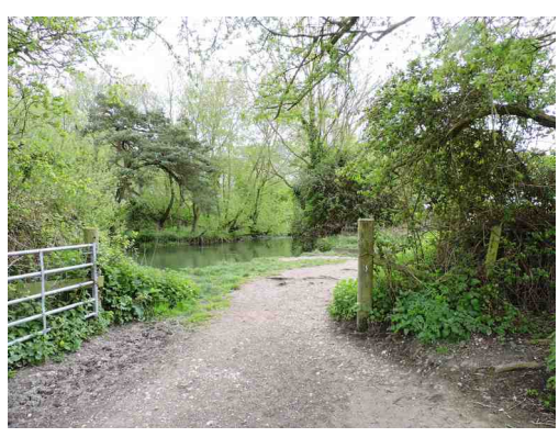
At the end of the field, the path goes through an open gateway, rejoining the river bank.