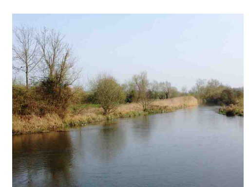
Eastern bank looking towards St Lawrence Close

Exit the bridge and just past the wooden fencing, turn left through the wide gap and follow the footpath towards a wooden bench.