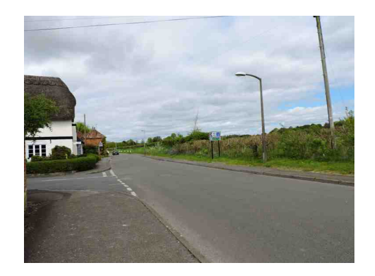
Mill Lane/Stratford Road junction

START: from the junction of Mill Lane and Stratford Road - OS Map reference SU132 323