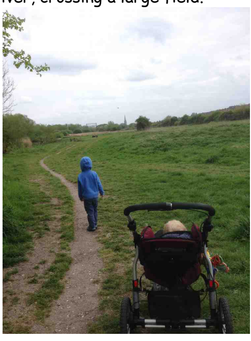
Note the cathedral spire approximately 1.5 miles away.