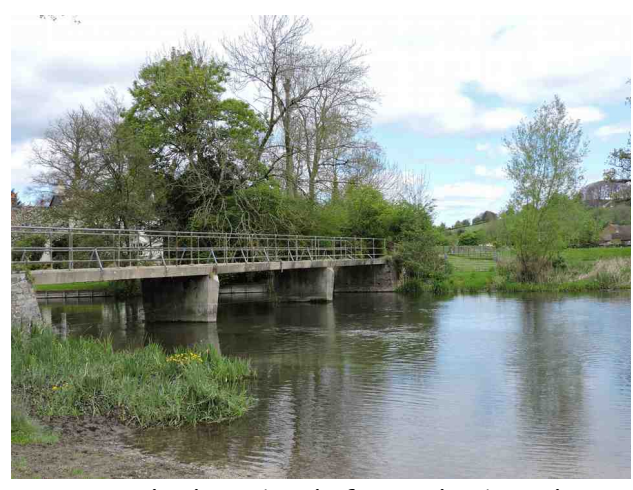
View looking back from the bench.