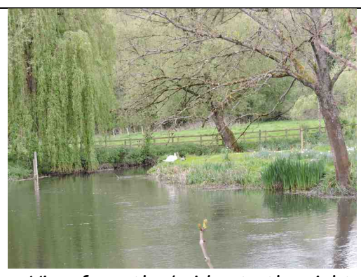
View from the bridge to the right

Follow the footpath as it crosses over the River Avon via a pedestrian bridge. Look out for swans, ducks, moorhens, coots and if you're lucky, a kingfisher.