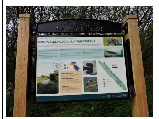
Distance from Start 1.1 miles