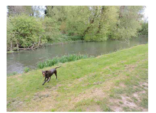
Five Rivers Leisure Centre is behind the trees.

At the end of the boardwalk is an information board for the Avon Valley Nature Reserve. Ignore a path to the right and instead continue on the river path as it rises gently onto a raised bank. To your right, there's a recreational area and as you progress along the path, you will see a fenced play area suitable for young children. Distance from